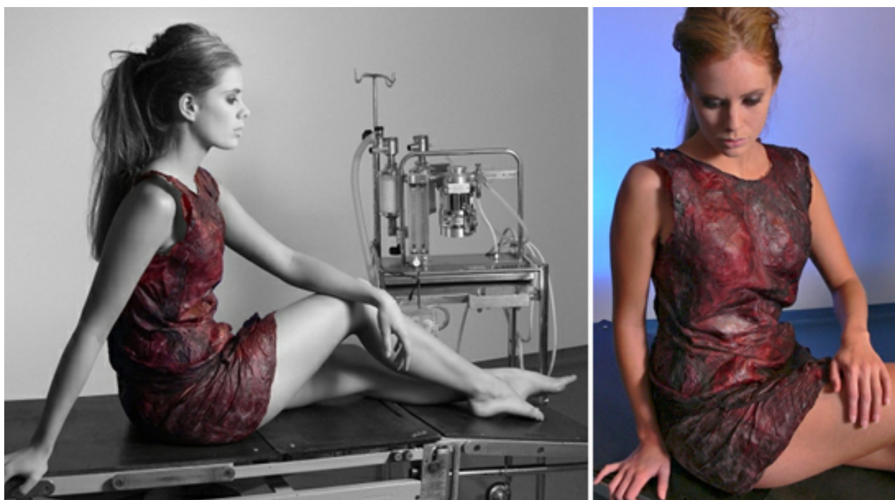
Figure 1: Red wine dress [2]

A global specialty materials company whose products are widely used in various areas of people's